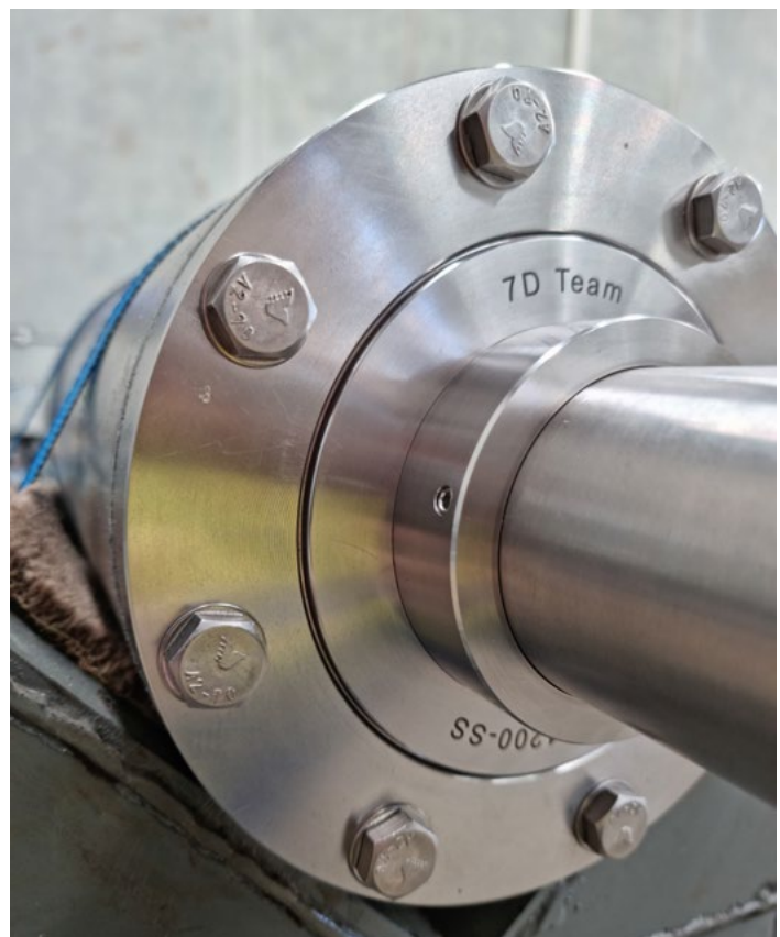
Full Safer-Series bearing housing featuring a Bulwark bearing isolator system